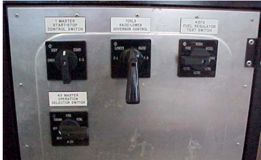
Fig. 4: Replacement Selector Switches (43 Switch in lower left-hand corner)

A replacement panel built by PAL Engineering is shown in Figure 4 below. It shows several modern switches including a 43 Operation Selector Switch in the lower left side of the photo.