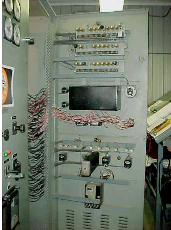
Fig. 2: Rear view of turbine control panel showing the long selector switch body (center, lower)

The operation selector switch in Figure 3 below is damaged. Two straps are required to support it with braces on the back panel. These switches can be replaced, if necessary. However, they are not regularly available on the market in new old stock (NOS). The switch in Fig. 3 below often “wiggles” out of position, sometimes causing the turbine to TRIP during operation.