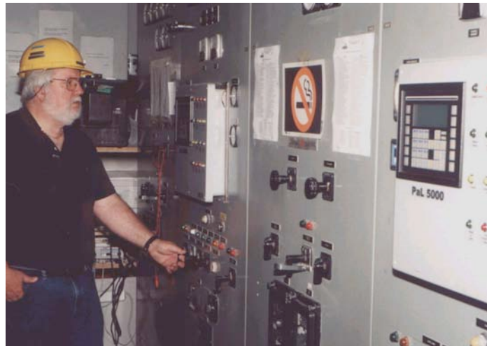
Fig. 1: Operation Selector Switch in Use by Engineer

There are many functions that depend upon switch location. Also, there are many electrical contacts and “make before break” functions associated with switch 43.