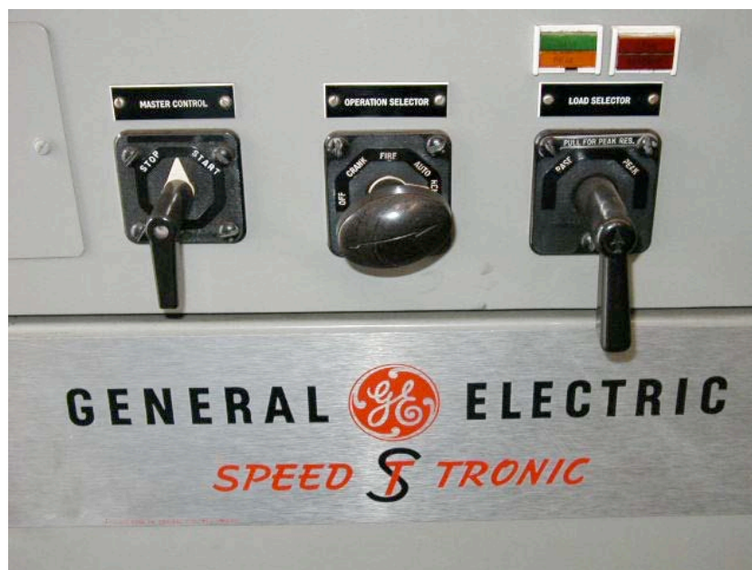
Fig. 3: Operation Selector Switch (called Switch 43)

Try this test. While the turbine is at rest, switch the Operation Selector Switch (called 43 Off, Crank, Fire, Auto or Remote) in the OFF position. See Fig. 3 below. It is currently shown in the REMOTE position.