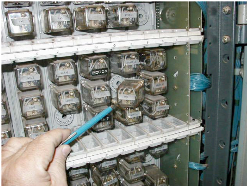
Fig. 1: The 4VC Relay

General Electric gas turbines installed in the early 1970s had a “mysterious” relay called 4VC . Since it is a “4” type relay, it suggests that it is part of the turbine’s Master Protective circuit. The VC name is curious, for sure. Consulting the index on a typical set of gas turbine elementary diagrams, you will find that the VC stands for VCE Clamp .