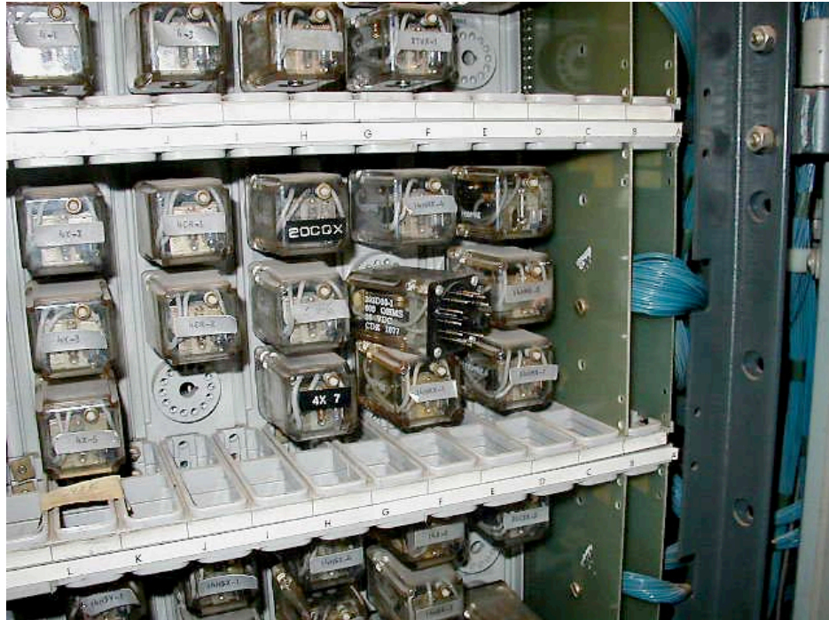
Fig. 6: Photo (center) shows 4VC relay removed from plug-in slot

used other than the “clamp” to analog common ( ACOM ). If not, you can use a spare annunciator or LINA circuit to indicate that the relay has failed.