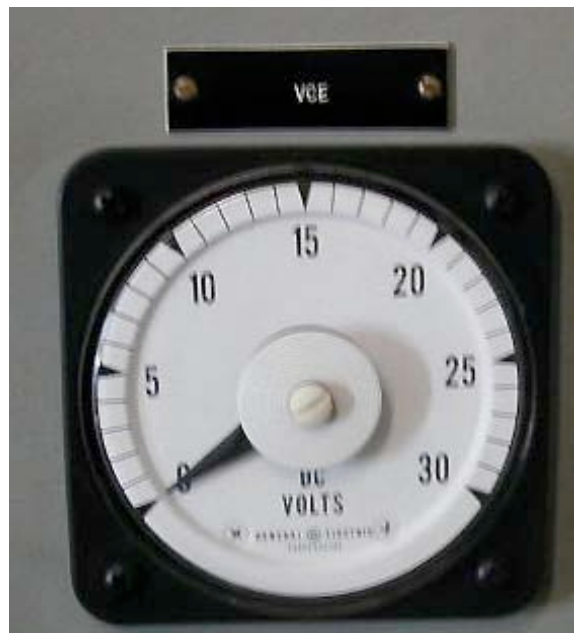
Fig. 2: VCE Panel Meter

So why, you might ask, is it there? A good question. If you have ever tried to test the start-up control just prior to start by pushing the buttons on the SSKA card, and VCE does not rise, it might be because the 4VC relay is burned out. Remember, the lamp inside the 4VC relay must show that it is energized, or these pushbuttons will not work.