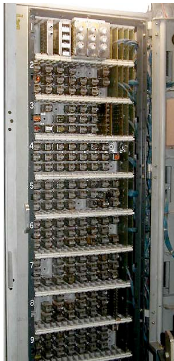
Fig. 5: Relay Panel inside Speedtronic™ Door

If the VCE needle does NOT rise, open the panel and see if the 4VC relay is energized with its internal light ON . If it is not energized, remove relay 4VC and perform the test again with the pushbuttons. Now replace the faulty relay.