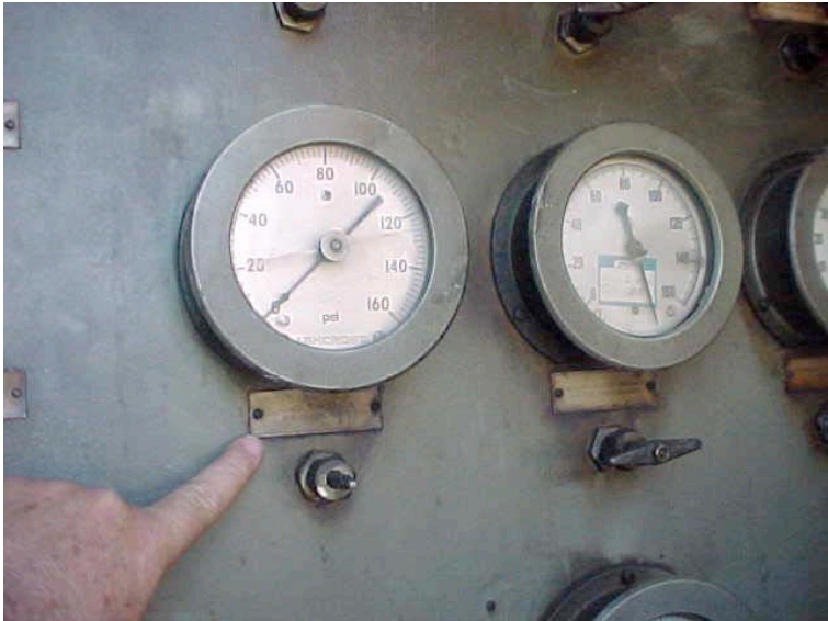
Fig. 3: Compressor Discharge Pressure (PCD) Gage